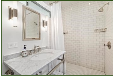
Ladies Lounge Bathroom