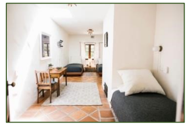
La Casa Bedroom II