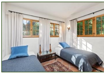
La Casa Bedroom I