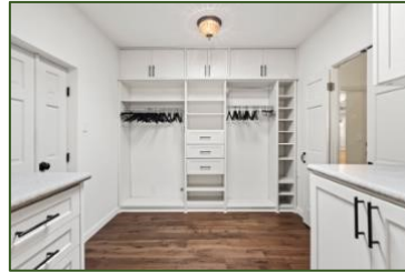
Ladies Lounge Closet