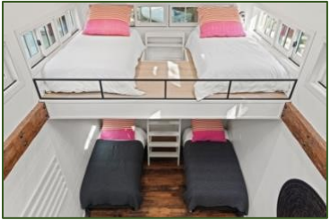
Ladies Lounge Loft Room