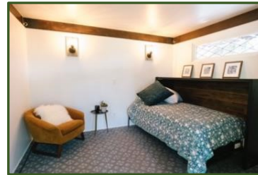
Tea House Single