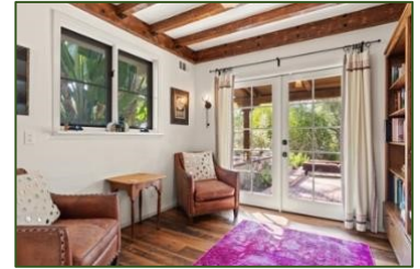
Ladies Lounge Library