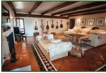
La Casa Living Room