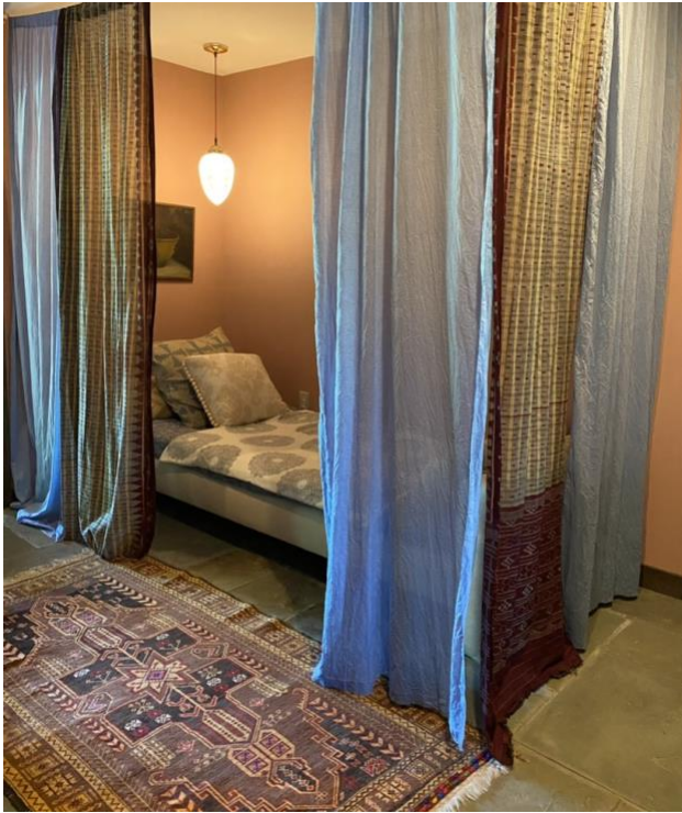
Lower Level Sleep Space: Single Bed. Adjacent Bathroom. Semi Private but also part of the common space as it is adjacent to the yoga room.