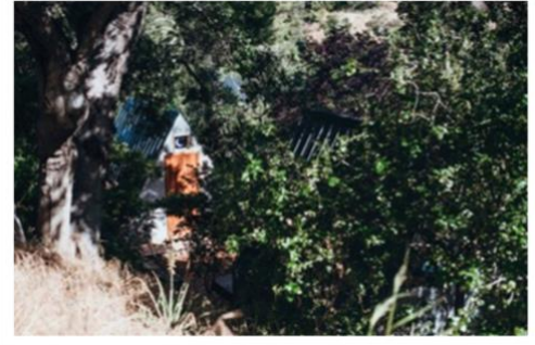
A-Frame Cabins (single or double)