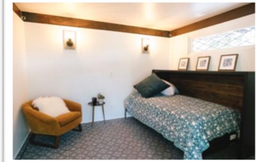
Tea House Singles (single)