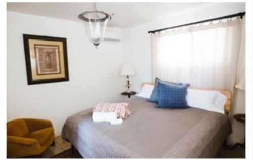
La Casita Master (single or double)