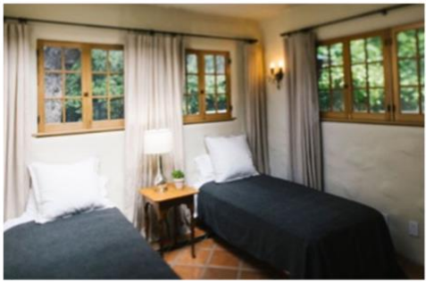
La Casa Bedroom (single or double)

Lodging will be assigned on a first come, first serve basis.