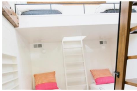
The Loft Lounge (double or triple)