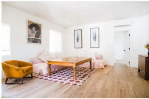
La Casita Living Room (single)